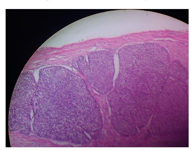
Figure 5 view under 40X microscope